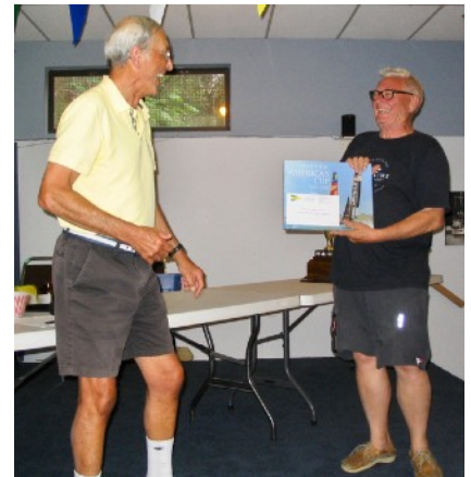
Winner of the Skippers' Draw Flattery (Dal)