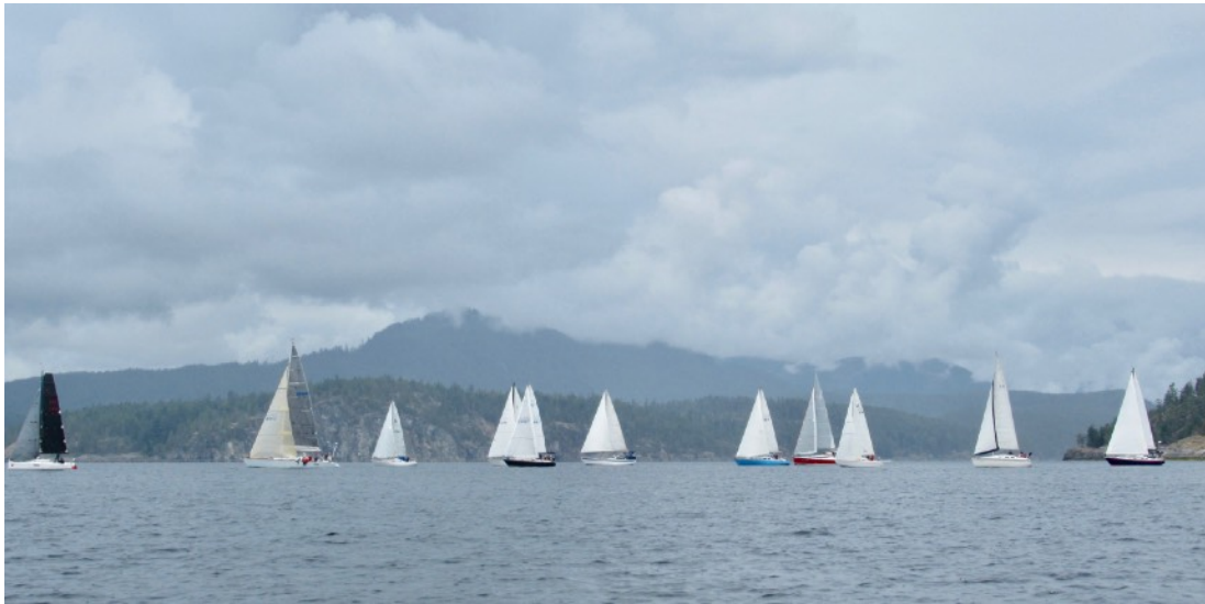
The Start of 30th. Malaspina Regatta